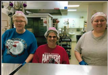
Operation Round-Up funded more than $86,000 in donations to 61 local nonprofits.