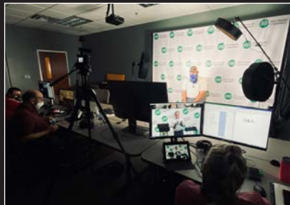
Safety demonstrations and educational presentations were virtually presented to more than 3,480 students and professionals.