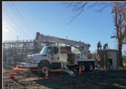
Connect 2 First Internet began the build out of a fiber infrastructure which will eventually make high speed internet available to our members.

First Electric's employees strive to provide you – our members - with the best member service possible. Almost 9,000 surveys were sent and nearly 12 percent offered feedback about their experience with the cooperative. The data collected rates office staff, field personnel and overall quality of service provided.