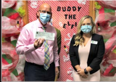
Over $9.56 million was returned to our members this year in capital credits.