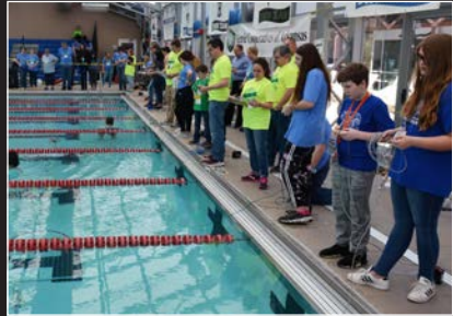
More than 82 community events were sponsored including the Arkansas 4-H SeaPerch Challenge and multiple local spelling bee contests.