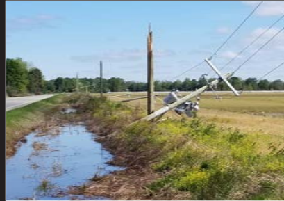
When severe storms caused major outages for our Stuttgart district, our crews worked tirelessly for days to replace over 190 power poles and miles of downed power lines.