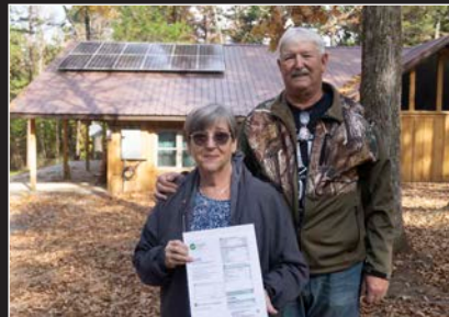
We installed our first residential solar array. The 4.62kW array was installed in Greens Ferry in Cleburne County.