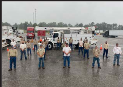
Our crews aided other cooperatives in state and out of state with power restoration due to storms like Hurricane Laura.