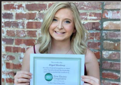
Nine high school seniors were awarded $17,000 in scholarships from Operation Round-Up.