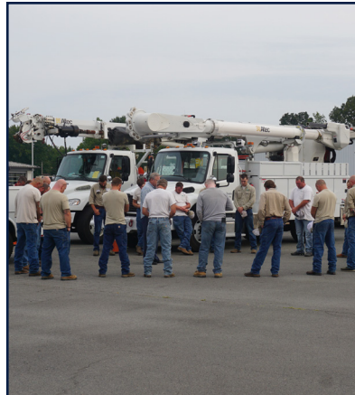
First Electric dispatched 21 crewmen to Washington-St. Tammany Electric Cooperative in Franklinton, LA to restore power after Hurricane Ida hit in August 2021.

We're proud of the job our employees do at First Electric! You – our members – responded to survey questions about the level of service you received from our staff and field personnel. They scored over a 95% when asked about their overall level of satisfaction with service.