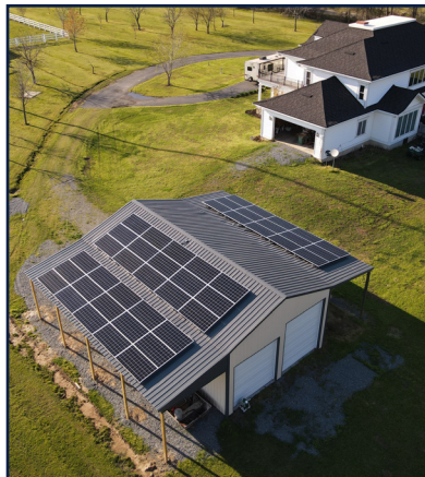
Solar Services installed a 17.325 kW solar array in Humphrey, Arkansas.

With over 900 cooperatives in the country, it creates a great network to help in times of need. One example is during storm restoration, cooperatives extend mutual aid to other co-ops and utilities to restore power to their members and customers quickly.