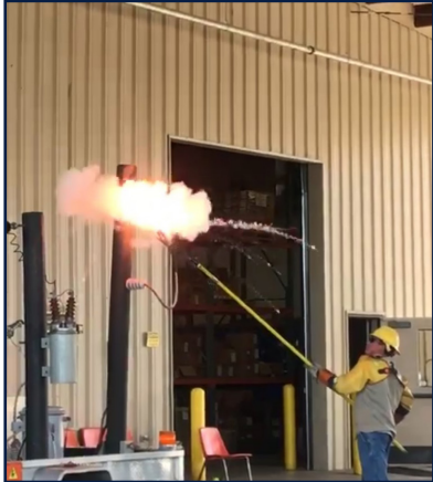
October 19, 2021 we presented our high voltage safety demonstration to a group of first responders, road workers and utility crews at our Congo Operations Center.