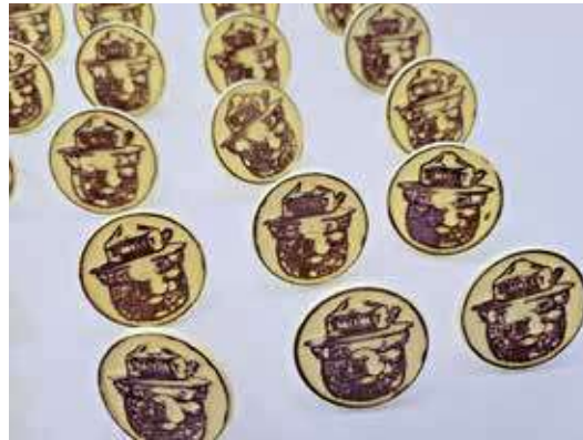
One of the first and most iconic products Bentley Plastics of Perryville produced were Smokey Bear rings for the U.S. Forest Service.

Bentley Plastics also has a line of Arkansas Razorback drinkware available online at bentleydrinkware.com/collections .